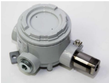
Sensor without display